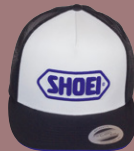
– Trucker Cap white/blue