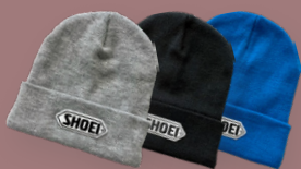
– Beanie grey / black / blue