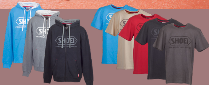
– Zip Hoody blue / grey / black