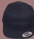
– Basecap black/black