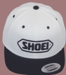
– Basecap white/black