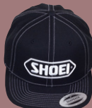
– Basecap black/white