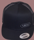
– Trucker Cap black/grey